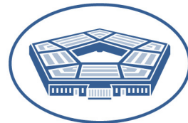
U.S. Department of Defense